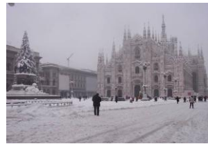
MILAN * WINTER

° optional gondola serenade (35 minutes about) at euro 35.00 per person